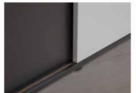
Lockable sliding doors.