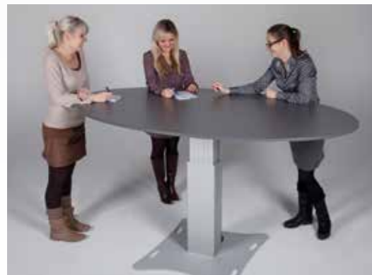
Height adjustable meeting table, page 191.

Our perfect solution for your meeting room – height adjustable interactive touch displays and height adjustable meeting tables in different shapes. Your chance for the perfect first impression.