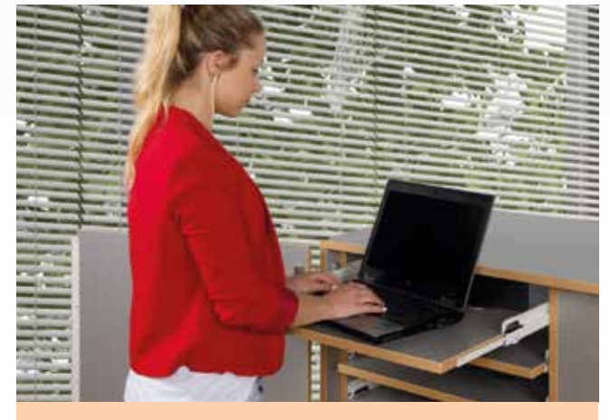
Choice of pull-out shelves or shelves