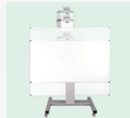
Height adjustable in board mode

This WorkITdesk is freely height adjustable, the stroke is 50 cm. Next to the height adjustment, you also have the possibility to stop the table in any angle you want and to adjust the height in this position.