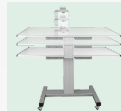
Height adjustable in table mode