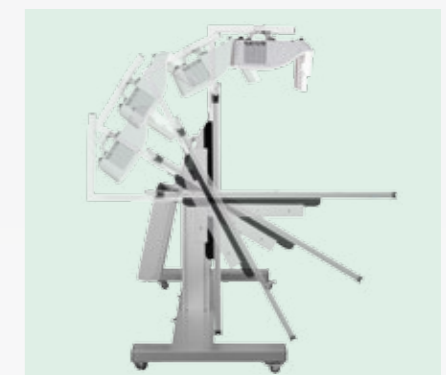
0 – 90° tiltable