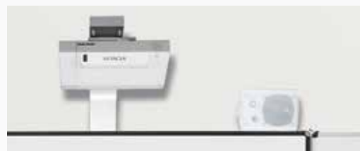
With holder SM-HDL