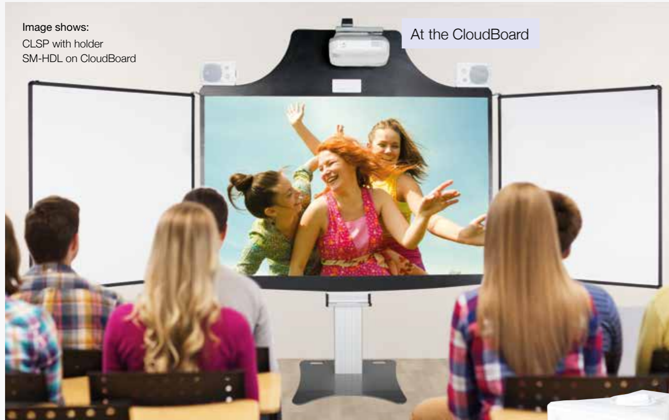
At the CloudBoard

Image shows: CLSP with holder SM-HDL on CloudBoard