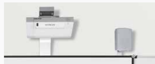
With holder SM-HDT