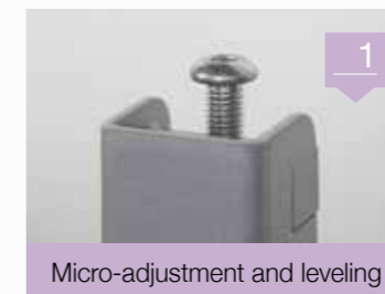
Micro-adjustment and leveling